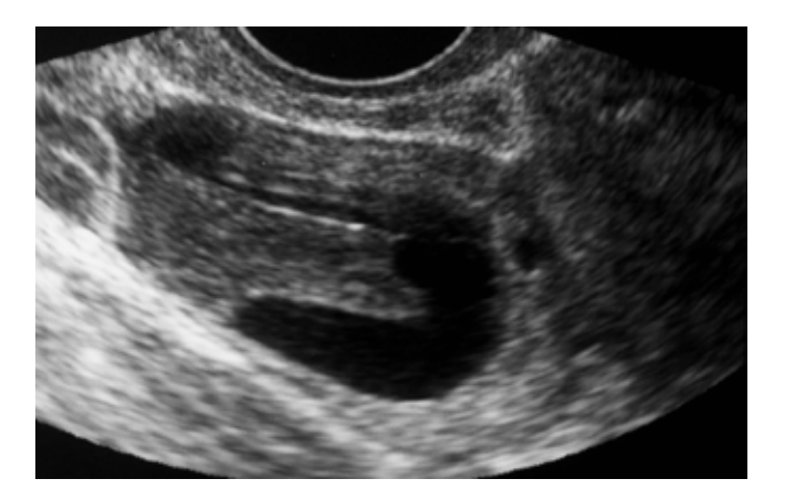
Figure 2. Transvaginal ultrasonography (US) shows a rectangular hypoechoic lesion in the cystic mass